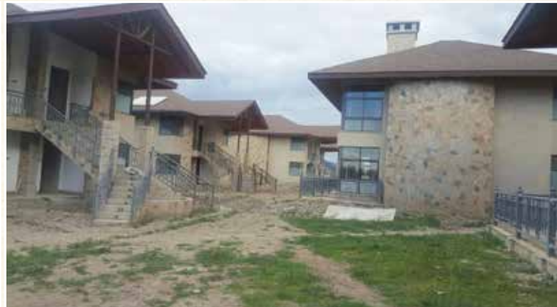
CONSTRUCTION PROGRESS - October