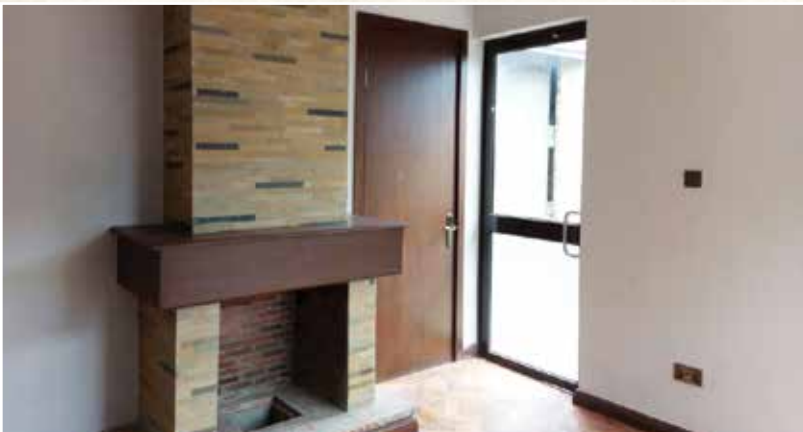
CONSTRUCTION PROGRESS - October