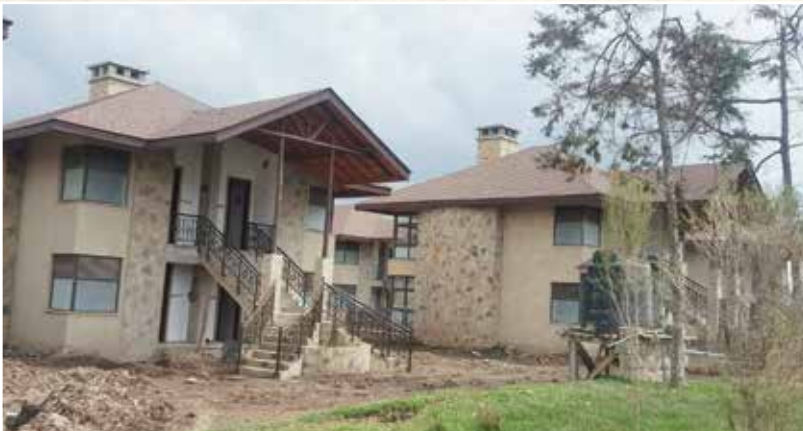
CONSTRUCTION PROGRESS - October