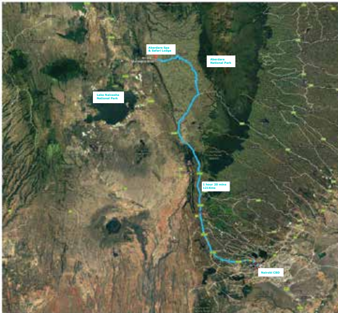
GOOGLE LOCATION MAP