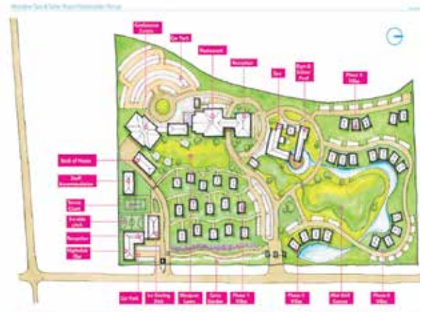
MASTER PLAN LAYOUT