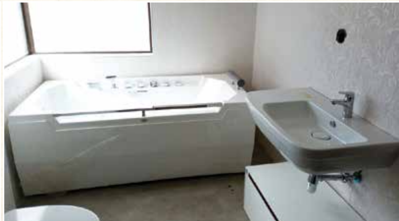
CONSTRUCTION PROGRESS - October